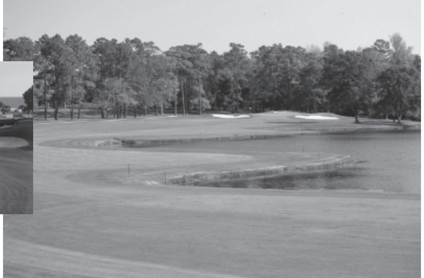
Above - Dunes #13 "Waterloo" - Par 5