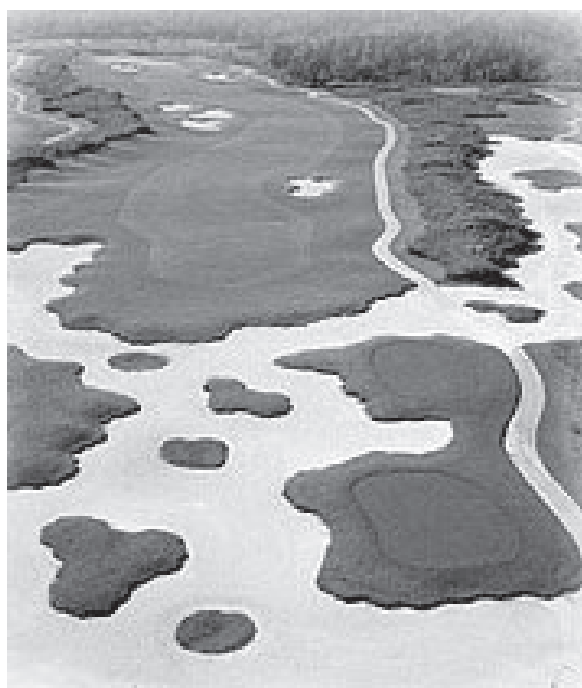
Thistle #6 - South Course - Par 4

Head Pro Gene Weldon has arranged for an outstanding rate of $45 per person. Tee times begin at 8:24 am. Better call 843-390-3200 quickly to reserve your time. Deadline for saving space is July 10, 12:00 noon.