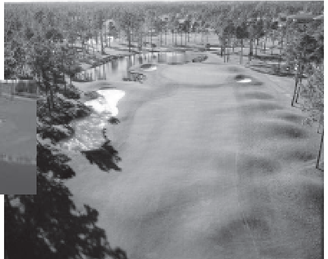
Above - Jones Par Five 9th