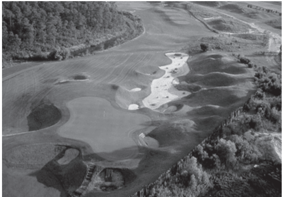
Moorland Par Four 16th featuring "Hell's Half Acre"

As one of only two South Carolina golf courses to make Golf Digest's recent ranking of "Toughest Courses in America," the Legends Moorland Course (ranked #37) can proudly stand as the only Grand Strand course to make the "Toughest" list (Kiawah's Ocean Course ranked #1 among all courses). It seems that whenever the Dye name is associated with the creation of a golf course, the words "extremely challenging" usually make it into everyone's description of their playing experience. In this case, the Dye association comes from P.B. (not Pete) and, according to reports from players, yes, the course is tough but it is also fun. Characterized by large expanses of natural growth, sand, water and waste areas, the course also features multilevel fairways and greens and, of course, the signature Dye bulkheads which create both visual interest and unusual hazard.