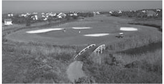
Bald Head hole #9 - Par 4, number one handicap hole

Bald Head Island markets its golfing experience as "A Sight-seeing Excursion." Sounds like an appropriate representation, however, the "sight-seeing" begins long before one arrives at the golf course. The island, set just off the Southeast Coast of North Carolina across the bay from Southport, requires an approximate 30 minute ferry ride just to get there. Automobiles are not allowed on Bald Head, so one gets around by golf cart, bicycle or on foot. Of course, this is one example of the focus on environmental preservation on the island established from the very beginning by developers. Even golf course architect, George Cobb, made sure he left much of the terrain the way he found it, creating a course of wild beauty. Many of the golf holes are completely undisturbed and are bordered by the