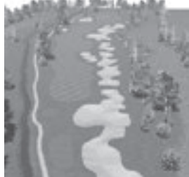
Crow Creek #17 - Par 4

Call 843-390-3200 by 12:00 noon September 18 to reserve your spot. A strict 48-hour cancellation policy is in effect since we must let Crow Creek know our final numbers 48 hours in advance. Members will be charged for cancellation after the 48-hour deadline without a compelling reason.