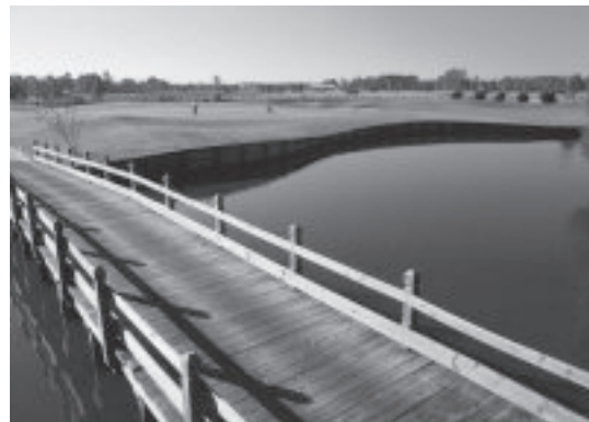
Crow Creek #8 - Par 3, all carry