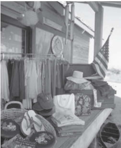
Shopping is plentiful at Bald Head

Cost for the ferry ride and golf round on October 18 will be $75.00 per person. If spouses or significant others accompany members playing golf, the ferry ride itself costs $15.00. Many love to go to the shops and restaurants located on the island. All participants will need to catch the 9:00 am ferry out of Southport in order to make tee times which begin at 10:04 am. Call the Pro Shop by 5:00 pm, October 15 to reserve your space. A strict 48 hour cancellation policy is in effect. Those who cancel after the 48 hour deadline without a compelling reason will be charged.