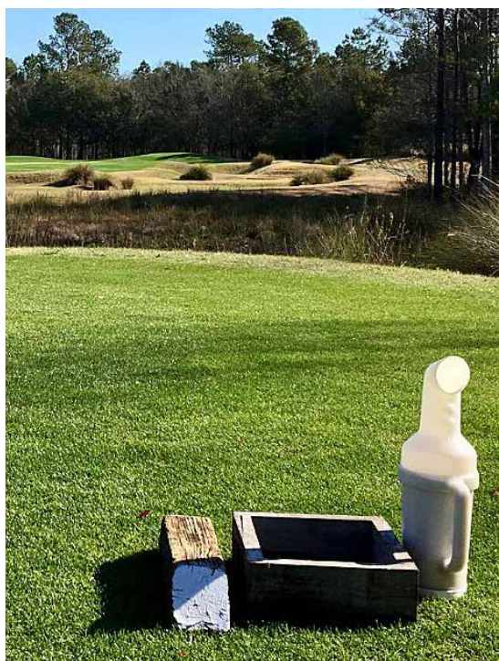
#9 OF LOVE

Love course is scheduled to be completed from 7/24-7/27. We appreciate your patience throughout this necessary maintenance period as it typically takes at least two weeks for each course to return to normal green speeds and conditioning. We hope you enjoy the courses and the improvements we've made during the winter season. Thank you for your continued patronage.