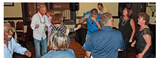
TOP: VARIOUS MEMBERS POSE AT THE MARDI GRAS HAPPY HOUR BOTTOM: MEMBERS SHOW OFF DANCE MOVES FOR DJ BUTCH