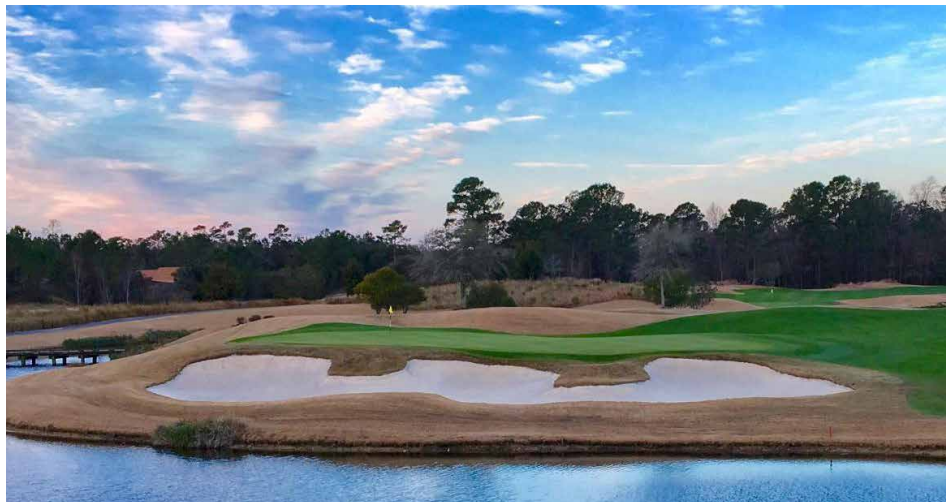
COMPLETED BUNKER RENOVATION OF FAZIO # 18

Barefoot Resort & Golf is very excited to announce the completion of many renovation projects that took place this past winter. In addition to the continued improvement of the cart paths, we have also added paving stones to the entrance/exit areas on numerous holes. The maintenance department has also completely rebuilt major bunker complexes on several holes, most notably number 18 of Fazio, as well as making improvements to many others. We have also recently removed several trees in